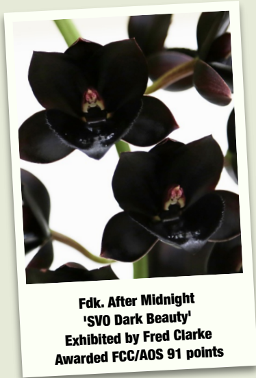
Fdk. After Midnight 'SVO Dark Beauty' Exhibited by Fred Clarke Awarded FCC/AOS 91 points