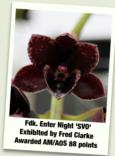
Fdk. Enter Night 'SVO' Exhibited by Fred Clarke Awarded AM/AOS 88 points